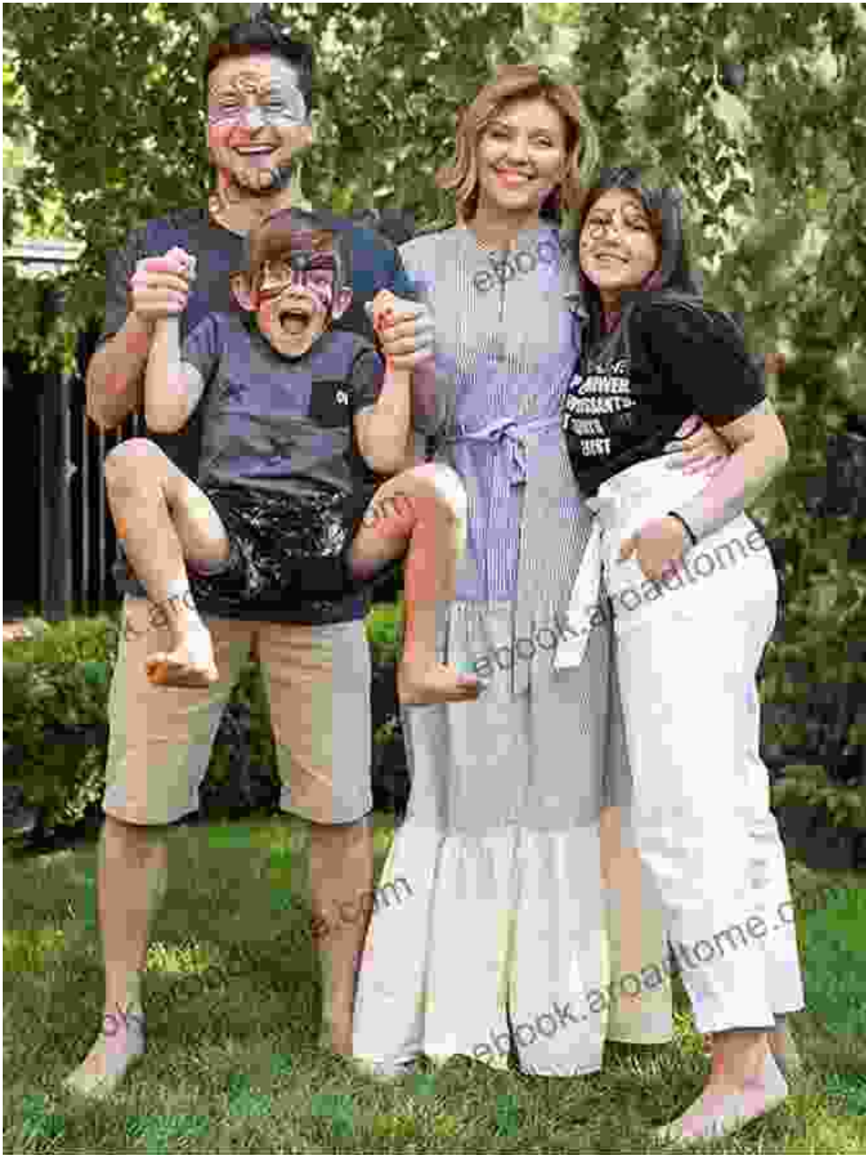
Meeting Volodymyr Zelensky