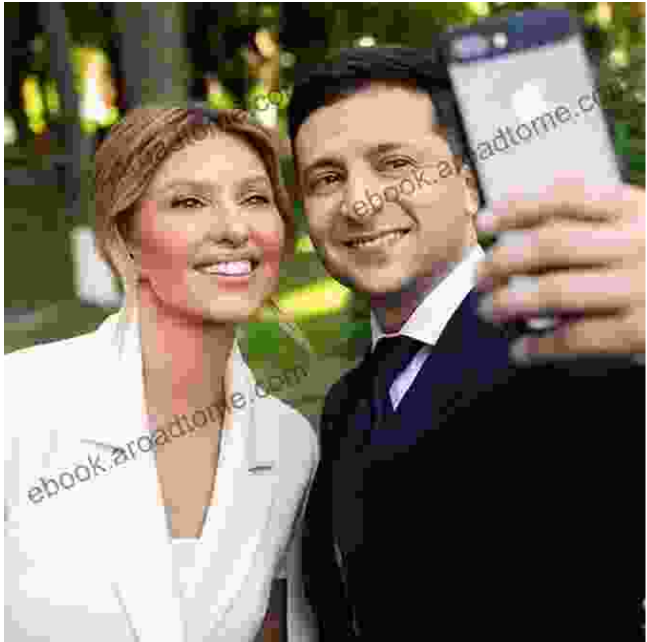
First Lady of Ukraine

As Volodymyr Zelensky's career in politics began to take shape, Olena emerged as his unwavering supporter. She played a key role in his campaigns, contributing her expertise in communication and media relations. In 2019, Zelensky was elected President of Ukraine, and Olena gracefully stepped into the role of first lady.