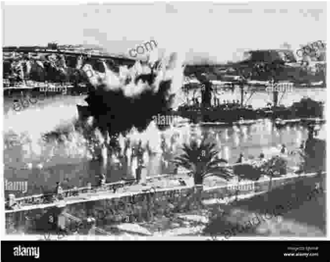
Malta under heavy bombardment during the Siege