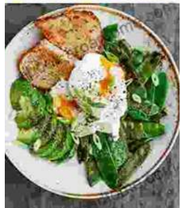
Heal Your Multiple Sclerosis: Simple And Delicious Recipes For Nutritional Healing