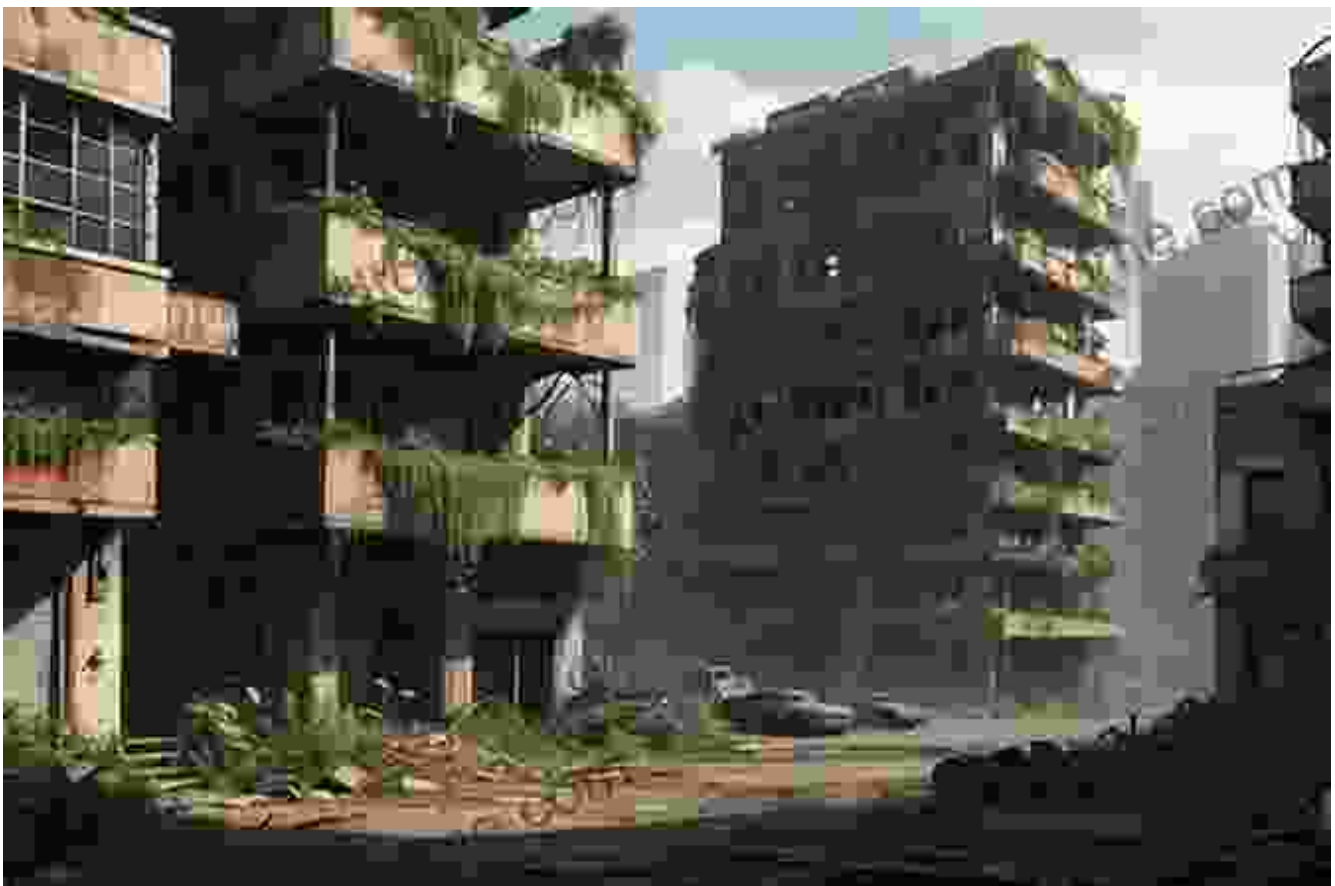
Silver City's decline

However, the boom times were not to last. As the mineral deposits dwindled, so too did the prosperity. The mines closed, and miners left in search of new opportunities. By the early 1900s, Silver City was on the decline, rapidly transformed from a thriving metropolis to a ghost town.