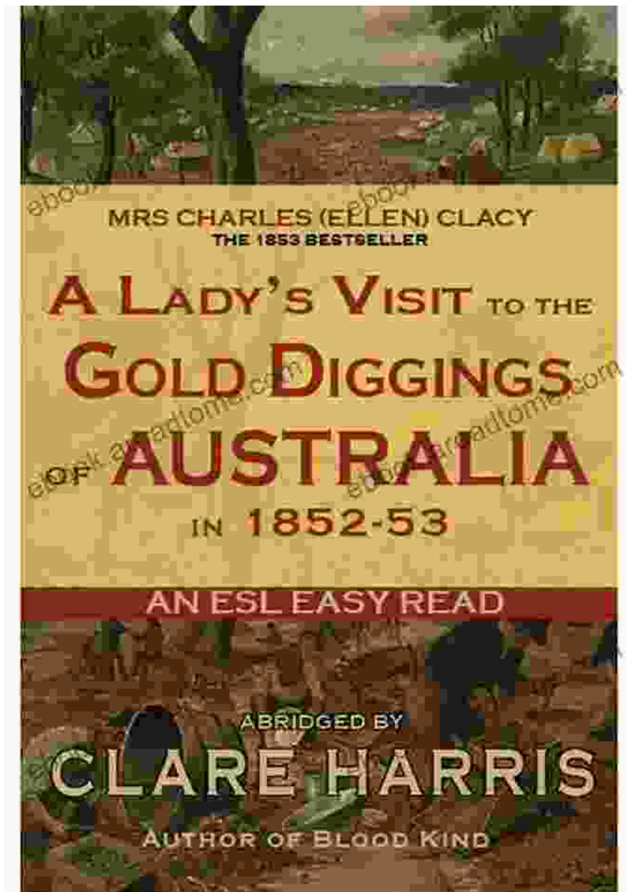
Lady's Visit to the Gold Diggings, A